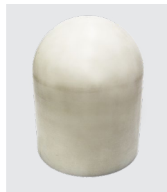
125mm bullet shape probe