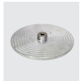
125mm diameter pressure plate